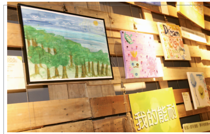
▲ 參加者的感動故事於思藝手作中展示出來。 Touching Stories of our participants were displayed at A-Souloorm.