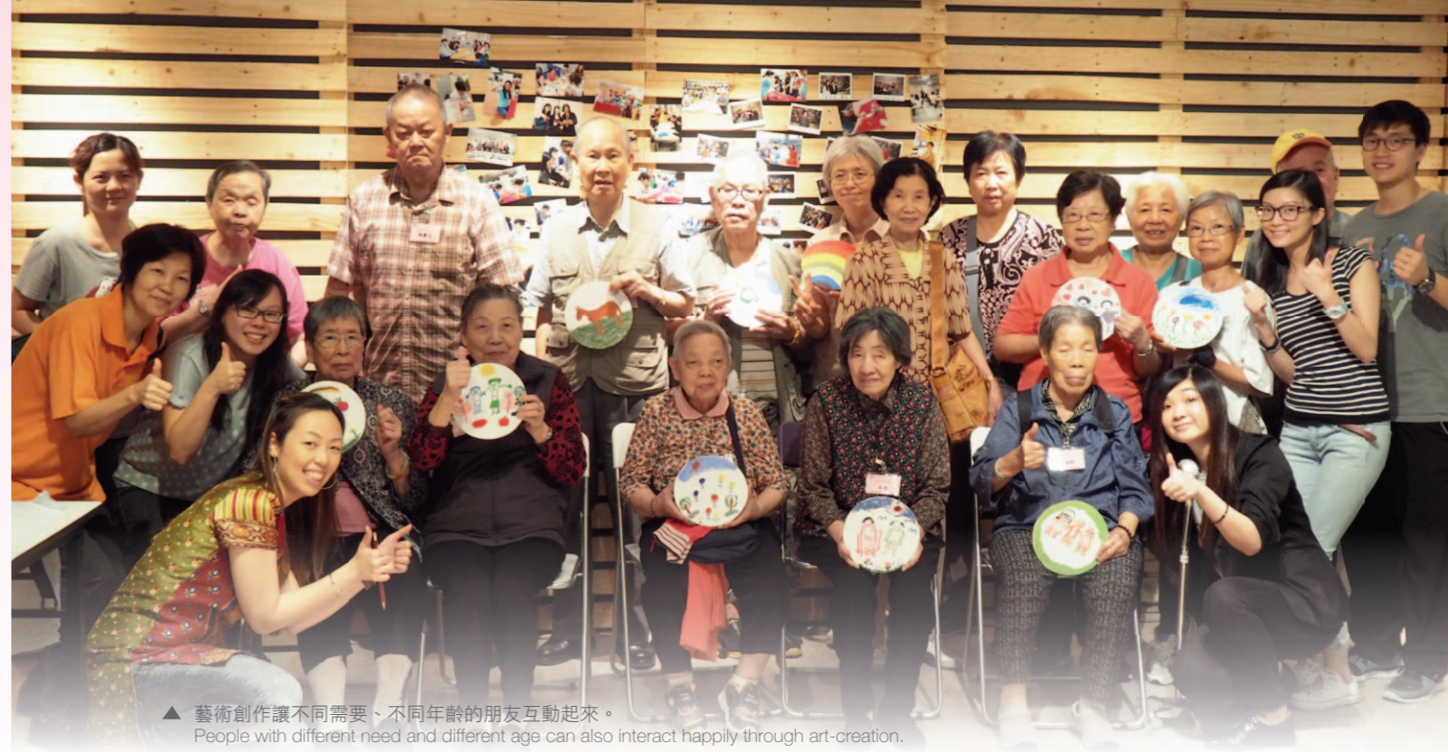
▲ 藝術創作讓不同需要、不同年齡的朋友互動起來。 People with different need and different age can also interact happily through art-creation.

Last year, our core service launched 2 respective projects aiming to expand further the career choices and opportunities for service users. Favourable impacts and fruitful outcome were resulted from the cross-over among different parties.